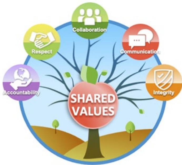
Figure 1. Our shared values are essential and enduring principles that are embedded in the culture of our organization. They are guiding principles for all the work we do as an organization and how we interact and work together.

Our continued success as an organization is challenged by the need to be more adaptable, illustrated by the impacts of climate change, changes in our workforce, shifts in budget priorities, and the evolving needs of our stakeholders. The broad purpose of our Strategic Plan is to envision our future as an organization and identify steps to realize that future that are intentional and proactive . This plan serves as an aid to help AKR leadership make decisions on where and when to place resources to improve our ability to achieve our desired outcomes.