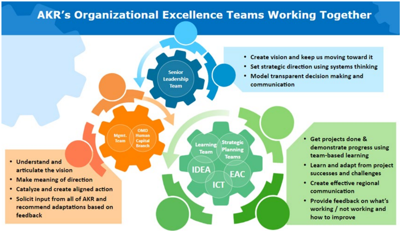
Figure 5. AKR's cross-divisional teams that work together to achieve organizational excellence.

enables us to foster cross-divisional working relationships to implement actions for the benefit of the entire organization to achieve our mission. The experience of working together in an inclusive and transparent way is foundational to how we do our work. We want to cultivate an environment in which all employees thrive and work together across the organization to achieve our mission and help achieve the objectives identified in our Strategic Plan.