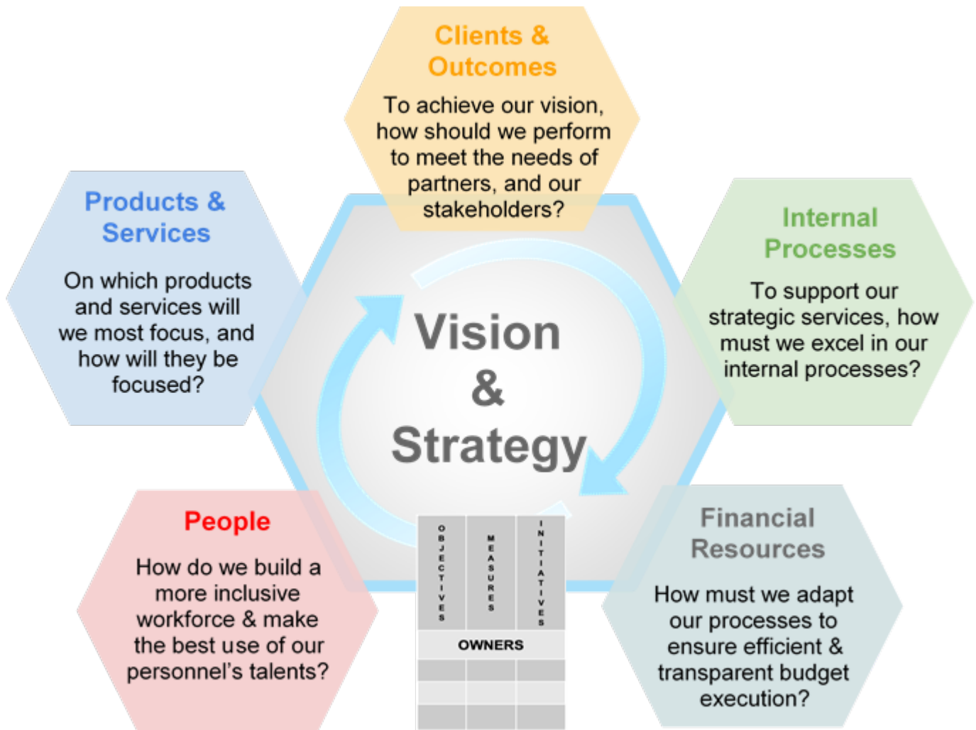
Figure 4. The AKR scorecard tracks objective measures and initiative along the five perspectives.